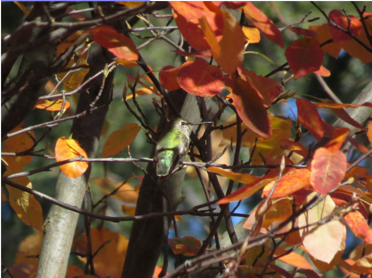
Anna's Hummingbird, York, PA 9.JPG