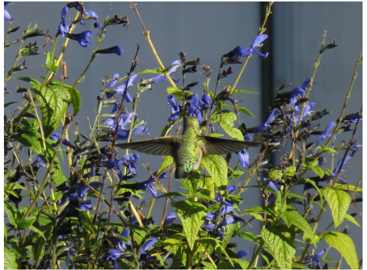
Anna's Hummingbird, York, PA 2.JPG