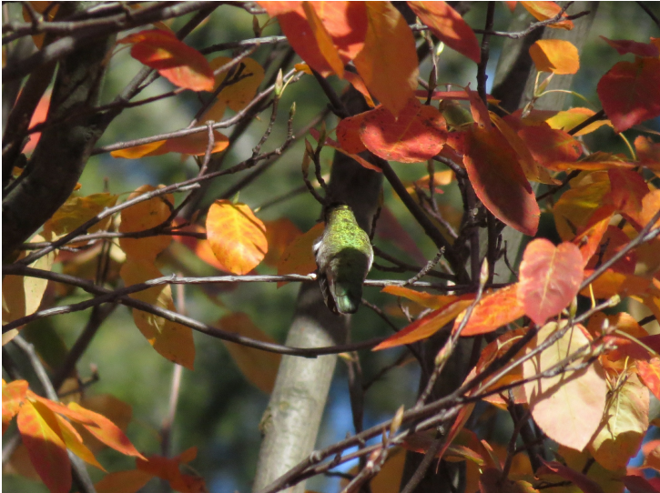
Anna's Hummingbird, York, PA 7.JPG