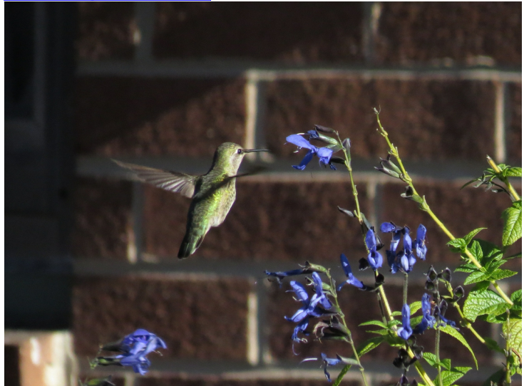
Anna's Hummingbird, York, PA.JPG