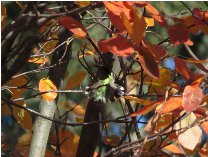
Anna's Hummingbird, York, PA 10.JPG