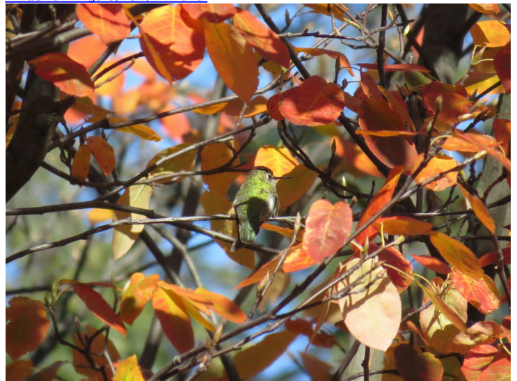
Anna's Hummingbird, York, PA 4.JPG