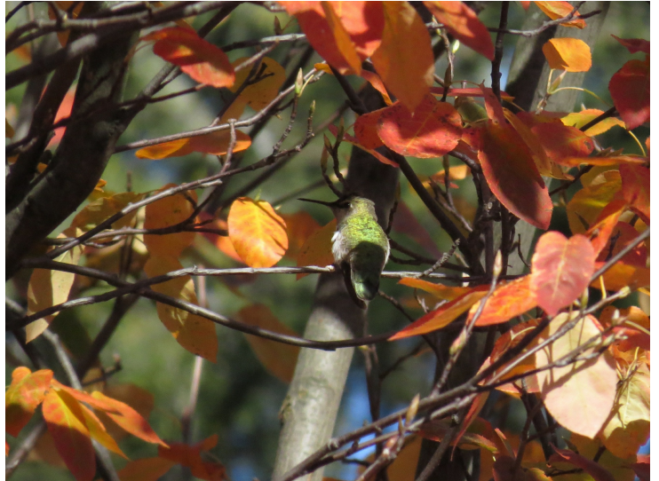
Anna's Hummingbird, York, PA 8.JPG