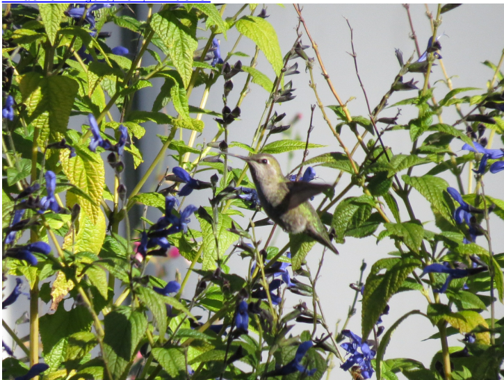
Anna's Hummingbird, York, PA 3.JPG