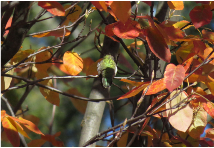
Anna's Hummingbird, York, PA 5.JPG