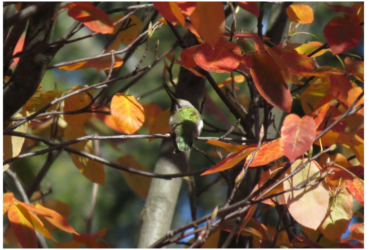
Anna's Hummingbird, York, PA 6.JPG